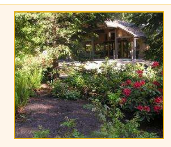
Mission The Center provides citizens ways to enrich their lives.

The Lake Oswego Adult Community Center, a division of the City of Lake Oswego's Department of Parks and Recreation, is a nonprofit service and advocacy organization located in the First Addition Neighborhood in Lake Oswego. It is a multipurpose facility offering recreation, education and social services programs for adults. Established in 1970, it was the first senior center in Clackamas County and is now the third senior center to be awarded National Accreditation. The population is 38,469. The center has over 1,700 active users with an email list of more than 4,000. The average daily attendance is 150.,