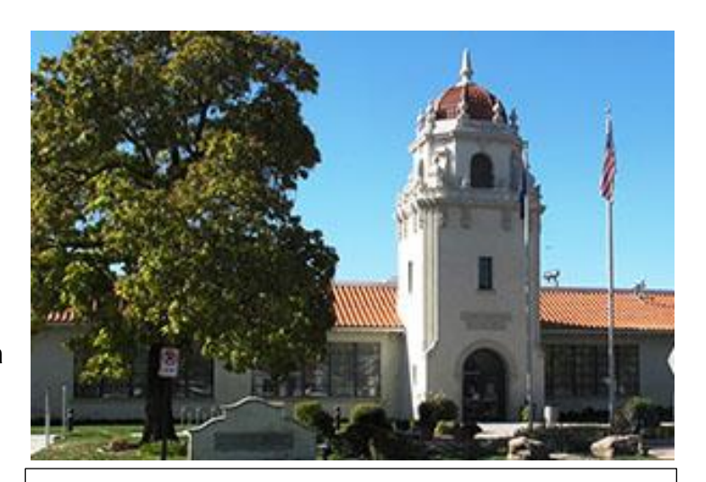
Mission Promoting independence of aging generations through advocacy, engagement and access to resources.

refugees and immigrants, many from Bhutan. The center is Bi-lingual with Spanish being spoken by staff and participants. Membership is 426 with a daily attendance between 45-60.